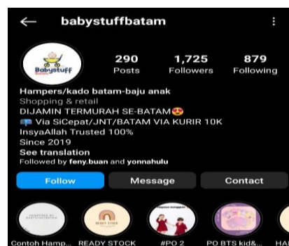
Picture 1. Logo and Instagram profile of Baby Stuff Batam