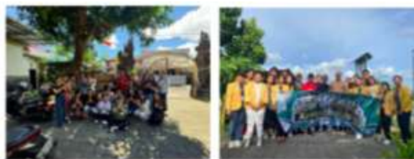
Figure 3. Activity Participants

Once all activities were completed, a group photo session was organized to document and commemorate the success of the program. The photo included the Village Head, Babinsa, Head of the Environment, local residents, and community service participants who had been involved in the event. This moment symbolized the collaboration between students and the community in advancing urban agriculture through the use of plastic waste. The residents appeared enthusiastic and proud of their achievements, while the community service participants were pleased to have shared their knowledge and experiences. The group photo also serves as a source of inspiration, encouraging the community to continue adopting and expanding sustainable farming practices in urban settings.