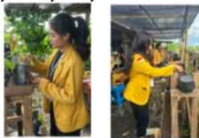
Figure 2. Planting Plants with Urban Farming Method

The results of mustard greens cultivation activities using the pipe, soil, and used bottle integration method carried out on February 11, 2025 by community service participants in Peguyangan Village. This activity aims to increase public awareness of the importance of utilizing plastic waste as a planting medium, while introducing more environmentally friendly urban farming methods. In this activity, community service participants together with the community and the Village Head, Head of the Environment conducted training and direct practice in creating a simple planting system using used plastic bottles and pipes as a mustard greens planting medium. This method aims to optimize narrow land in urban areas and reduce the negative impact of plastic waste on the environment. With this program, it is hoped that the community will be more aware of the importance of innovation in urban agriculture and the benefits of reusing plastic waste. In addition, this method also has the potential to increase crop yields more efficiently, considering that the planting medium used can maintain soil moisture better and reduce water needs (Rahmawati et al., 2020). The sustainability of urban agriculture does not only depend on technology, but also on public awareness in implementing a more environmentally friendly lifestyle.