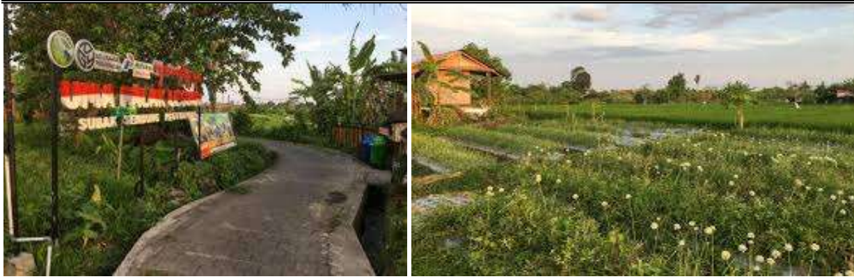
Figure 1. Location "Uma Palak Sari"