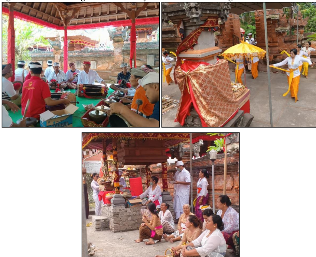
Picture 2. Image of the Ceremony Process

Long-term analysis shows that this integration also has sustained positive impacts, with increased community participation in the ceremony over time. This indicates that the steps taken in this research have successfully enhanced the relevance and sustainability of the ceremony in the long run. Further qualitative analysis also reveals positive experiences and a deeper understanding of the importance of organizational culture integration in maintaining the sustainability of local cultural heritage.